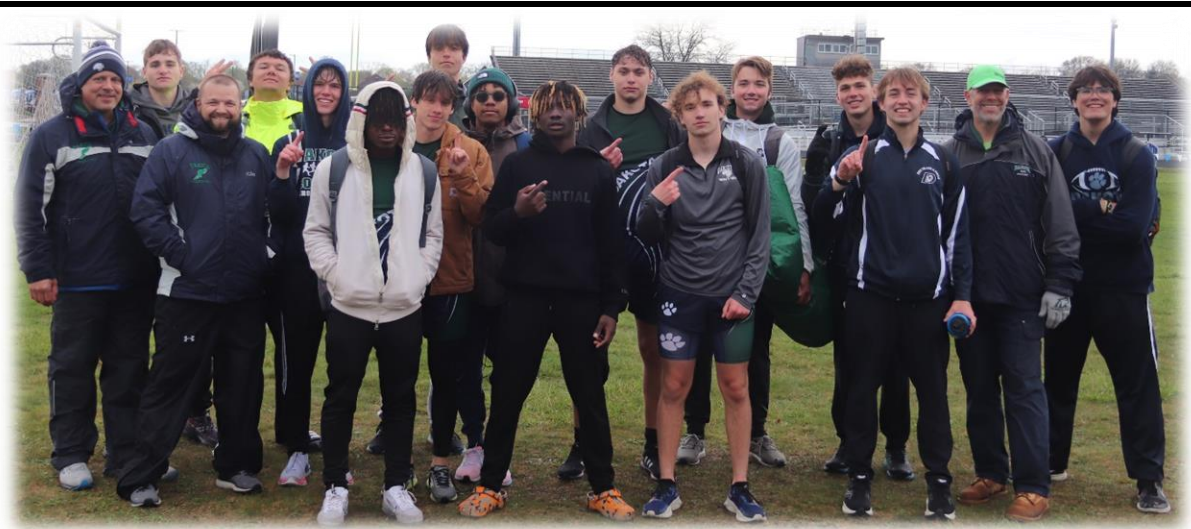
2023 Boys Royal Oak Relays Champions