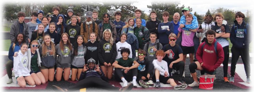
Both the Men's and Women's team pose for a picture after the Steve Johnson Relays. Both Teams would finish 2 nd place.