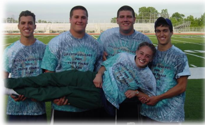
2004 State Qualifiers