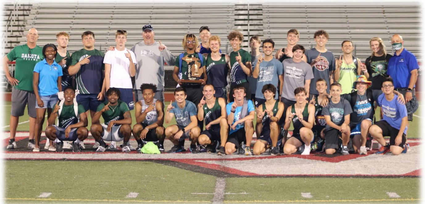
2021 MHSAA Division 1 Regional Champions