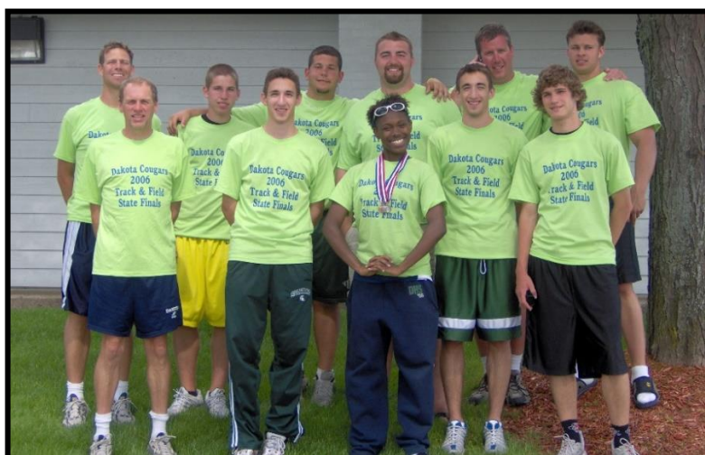
State Finalists in 2006