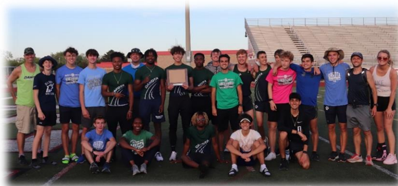
2021 MAC RED Division Meet Champions