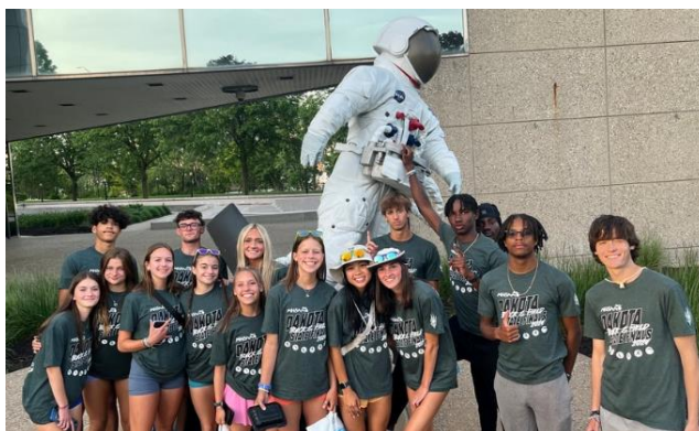
2024 State qualifiers Friday before the meet