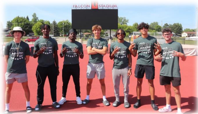
2024 State Finalists