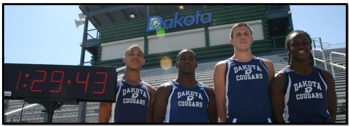
The boy's 4x200m Relay team sets the school record at the Team State Meet in 2014.