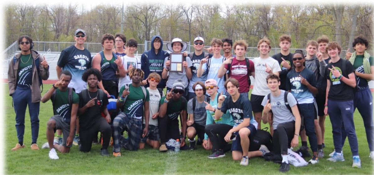
2023 Algonac Muskrat Classic Champions!