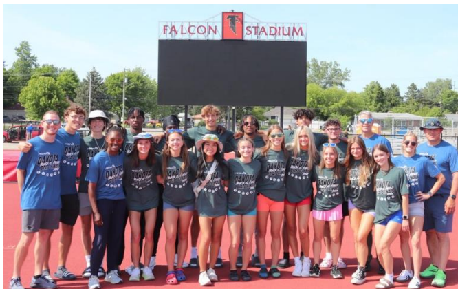
2024 state finalists